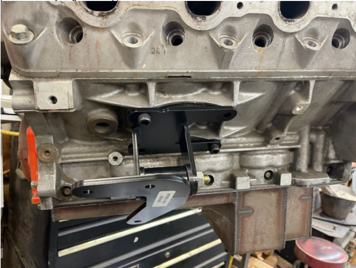
Detailed view of driver's side engine mount and frame bracket on engine

Locate the Driver's Side (LEFT) and Passenger's Side (RIGHT) motor mounts and loosely bolt them to the engine using the supplied 10mm allen head bolts, now loosely bolt the Driver's Side (LEFT) and Passenger's Side (RIGHT) frame brackets to the engine mounts using the supplied ½"-13 x 4" long bolts and nylon lock nuts. (The bolts will be tightened after the engine is set in place and everything is lined-up)