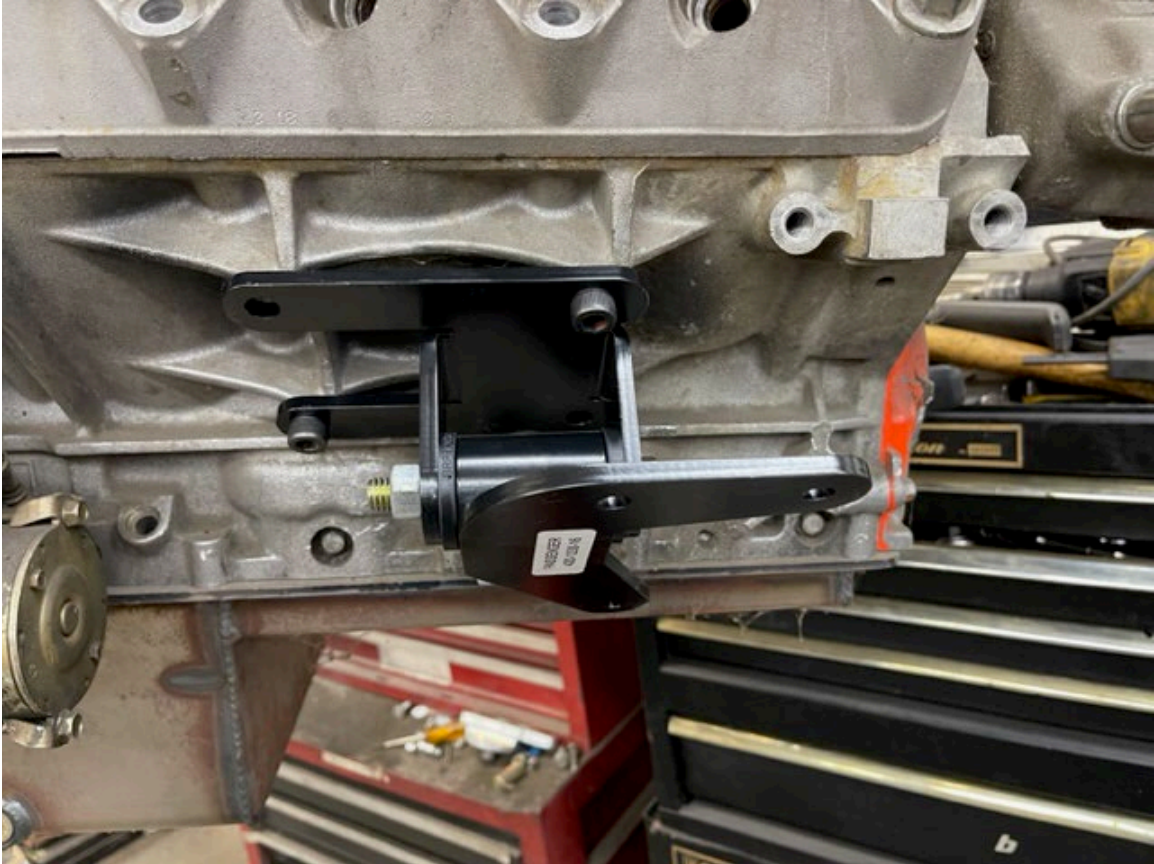
Detailed view of passenger's side motor mount and frame bracket on engine

Lower the engine into the chassis and align the frame bracket to frame bolt holes and loosely install the 3/8-16 x 1" bolts, flat washers and nylon lock nuts.